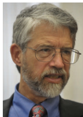
John Holdren co-chairs the PCAST council.